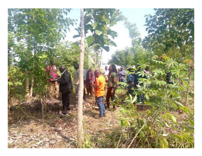
Photo: Sub counties officials from West Nile North during Go and See Visit at Ozugo Food Forest