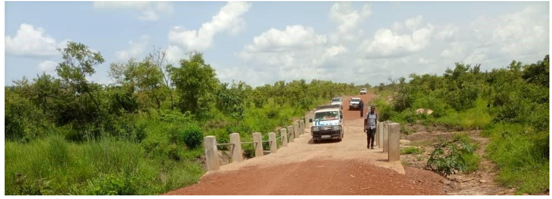
DRC improved road, Latebe P/S to Lugwar Central (3.7km and vented drift), Awic Microcatchment, Ogili S/C Lamwo. Cover photo : Interaction between farmers of Ebira A LSB group and teams from ISSD, NURI CF in Arivu S/C, Arua.