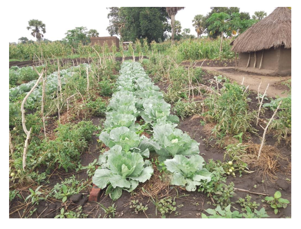
Ajuvule group, season A vegetables in Palorinja settlement, Obongi