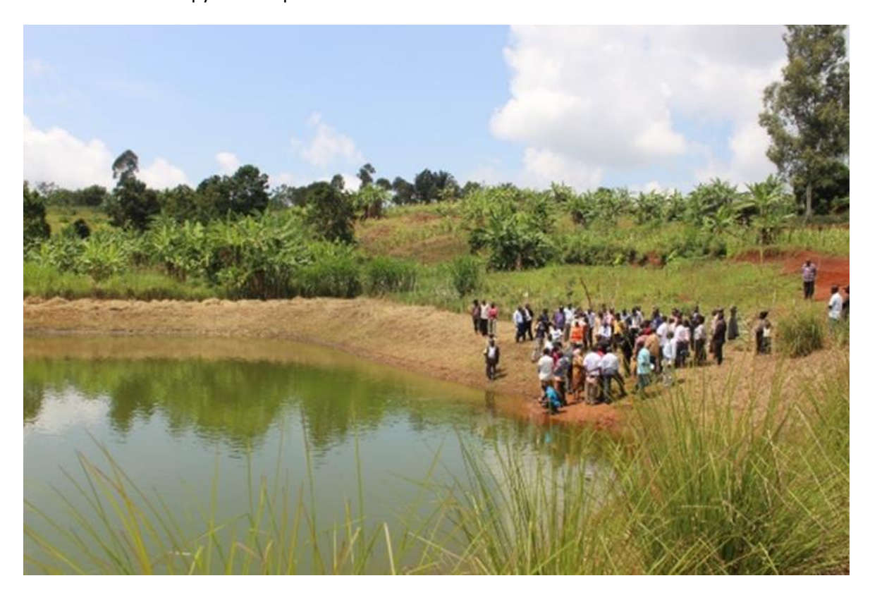
Photo: Sub counties officials from West Nile South during Go-and-See Visit at Jupazuba water pond

Go-and-see visits on Resilience Design were organized at 3 sites with participants from across the programme districts. The learning workshops and field visits were organised for sub-county officials as well as Community Development Officers (CDOs), LC III chairpersons and sub-county chiefs. The sub-county officials from West Nile South and Alur subregions visited projects in Nebbi, while West Nile North sub-county officials visited projects in Adjumani and sub-county officials from Acholi region visited projects in Lamwo. The visits took two days per location, including travel to host district project sites. The workshops included a presentation by DRC on the successes registered through resilience design. This was followed by field visits with practical explanation and demonstration of resilience design and engagement of PUC/WUC by the stakeholders. The activity ended with debriefing and discussions on what worked well and what didn't, what should be done differently, and how the ideas demonstrated can copy and adapt.