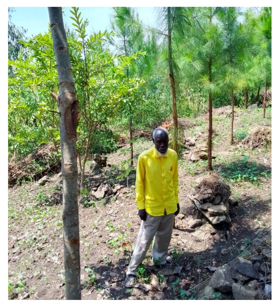
Photos: Follow up on Food Forest management at Owaffa primary school, Terego district.

Follow-up of water ponds, including the tree planting at these sites is on-going but with considerable gaps, with only 38 of 61 sites monitored by the responsible CSA Units in the first half of the year. With tree planting activities now complete, extension staff will focus on follow-up of food forests, including assessment of community maintenance, engagement and ownership.